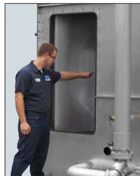
Man-Sized Access Door is Optional